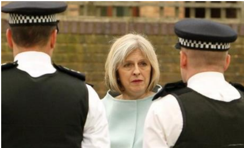
"we've had reports of you doing it again mrs May. we can see the wheat on your shoes"